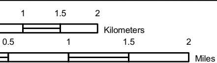
Appendix E Delineation of Subflow Zone Land Quad (Map 18 of 33)